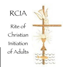
Becoming Catholic Through