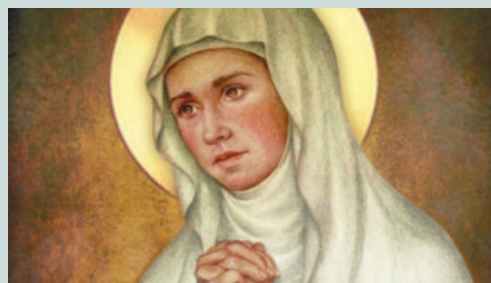
St. Angela Merici, Pray for us.